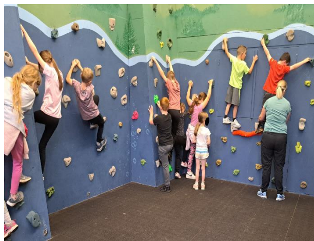
Indoor Climbing Wall